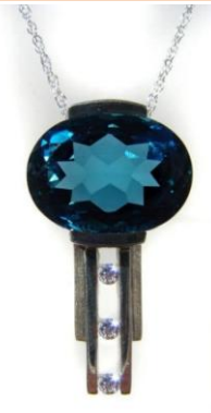
Topaz & Diamonds Ruben Designs

Have you had the pleasure of meeting the creator of artwork you considered or purchased? Isn't it fun? For a collector of contemporary works, the ultimate personal connection to a work of art is meeting the artist.